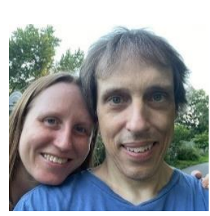
Together We love each other. We share values. We are beginning to garden life together, ...to replant our seedlings into one beautiful pot!

As a proud and caring educator and Jewish origami artist, I make, sell, teach and showcase the art form, all the while kindling creativity. Building a community with friends and family, students and teachers, and the little children of the future, is a love I cannot explain. Sparked by my Jewish roots, my aptitude in art, and joy in community, I value learning and social opportunities to grow and bond, above all with my soulmate.